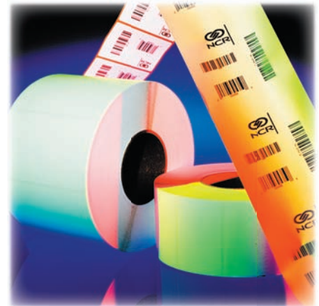
Quality Label Solutions to Ensure the Highest Scan Rates.